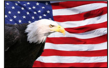
All TransData Products are Manufactured and Tested in the United States of America